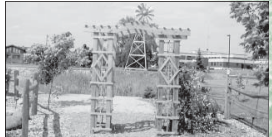
A student-constructed arbor serves as the entry into the wetland restoration project of the sculpture garden developed by BHS art teacher and 1969 alumna Paula Hanson.

"There are so many student projects available," Hanson said. The wetlands restoration, for example, has led to a significant